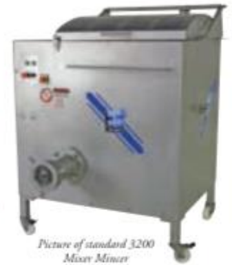
Picture of standard 3200 Mixer Mincer

The THOMPSON 3200 MIXER MINCER is designed to offer HIGH CAPACITY PRODUCTION in a COMPACT SIZE. Supermarkets, butcher shops and quality processing facilities will appreciate the performance of the THOMPSON 3200 MIXER MINCER. It is designed & built to withstand the HIGH DEMANDS OF LARGER PRODUCTION.