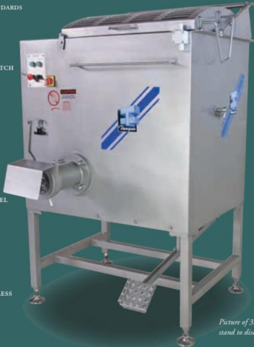
Picture of 3200 Mixer Mincer on stand to discharge into 200L bins

MORE POWERFUL 2.2Kw MIX DRIVE & 9.2Kw MINCE DRIVE